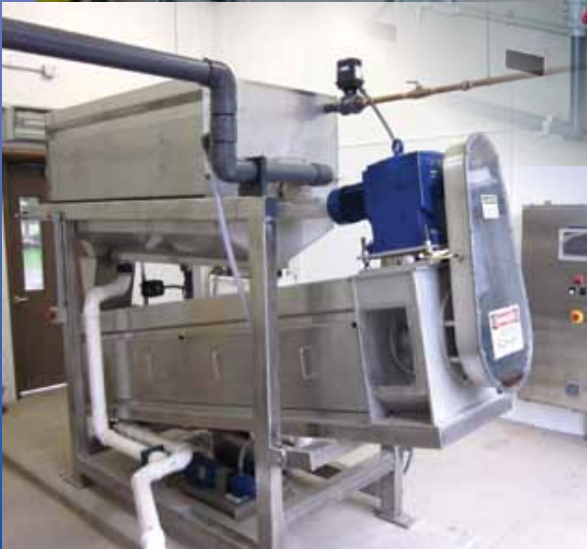
DSP Screw Press, Groton, NY WWTP