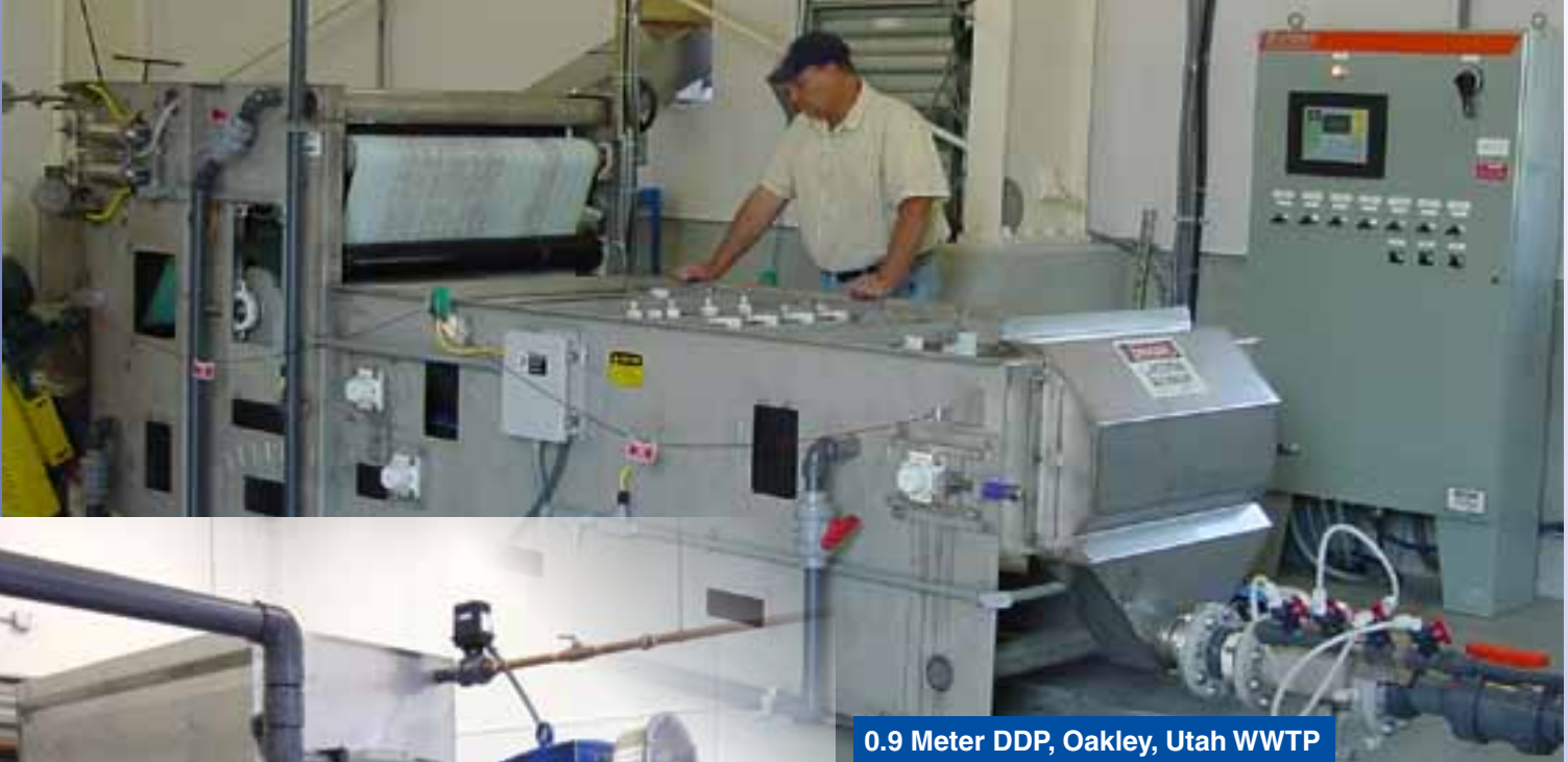
0.9 Meter DDP, Oakley, Utah WWTP