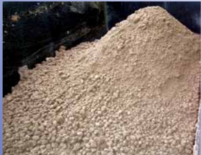
Dry granular discharge solids from the Screw Press