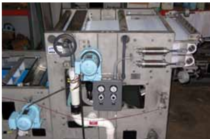
Vertical Pressure Zone

The unique low profile gravity zone, stainless steel plate frame, and stainless steel bearings provide ease of access and low maintenance cost.