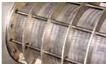
Slot Screen Design

SLOT SCREEN DESIGN: Prevents plugging, maximizes capacity. Perforated plate or wedge wire limits the porosity of the filter surface to 1 mm diameter due to structural issues. The DSP Screw Press uses a unique in-house fabricated water jet slotted screen design to allowing maximum drainage. The slotted arrangement /configuration and special wedge cross section profile of each slot prevents solids loss with the filtrate while allowing for maximum drainage by not plugging or blinding.