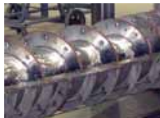
Tapered Screw Design

TAPERED SCREW DESIGN: Highest cake solids in the industry. A screw press functions by reducing the volume inside the perforated enclosure as the screw augers the cake toward the discharge. BDP Industries uses a tapered auger shaft. This creates a reduction in path length for the liquid to be expressed from the cake and causes a pressure force at right angle to the auger shaft and against the perforated drum. This reduces the tendency for plug formation and means higher pressures are possible or drier cake. Most manufacturers reduce the